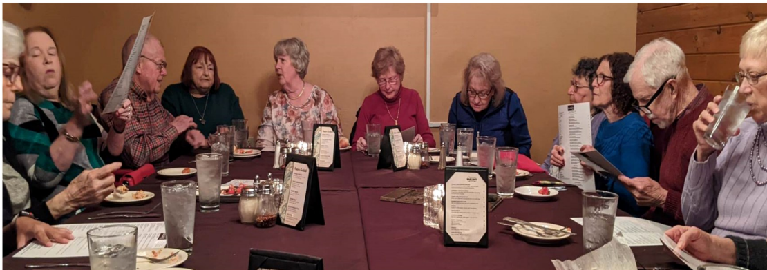
Gourmet gathered to sample the cuisine at MiScuzi recently