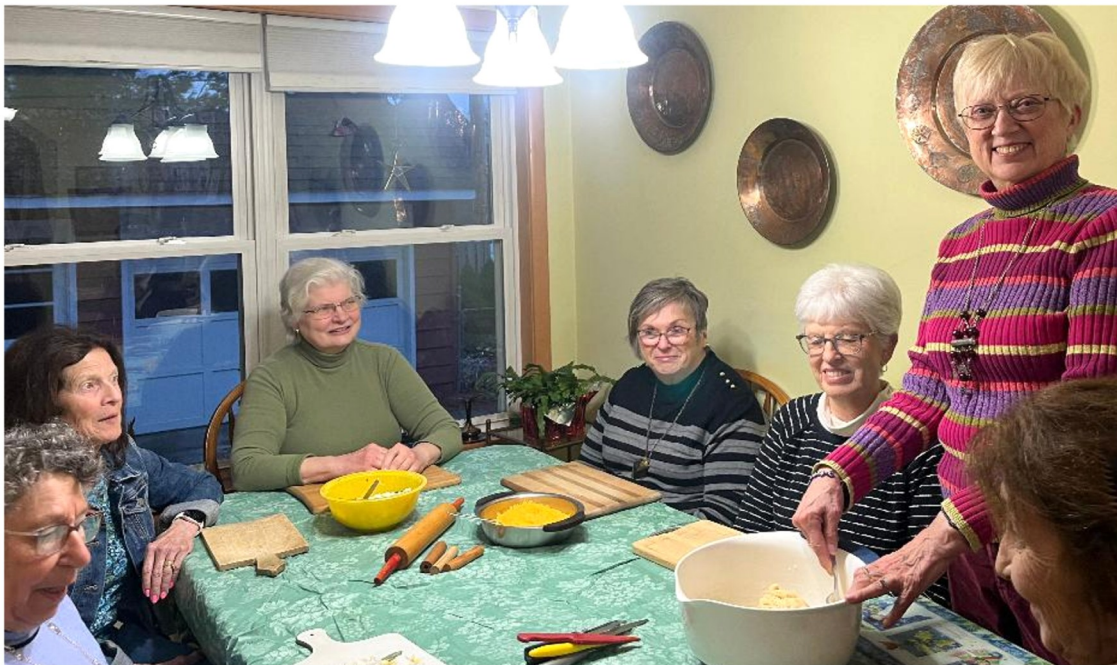
Global Friends study group attendees enjoyed a recent meeting while learning about Turkish baking, including Baklava.