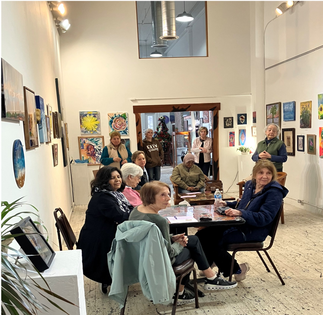
Branch members enjoyed a visit to City Gallery to view the works of local artists in April.